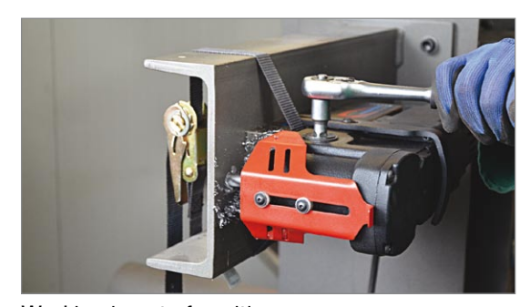
Working in out of positions.