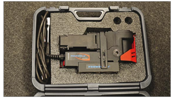
Handy plastic case