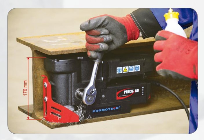
PRO-36 AD fits in the tightest spots