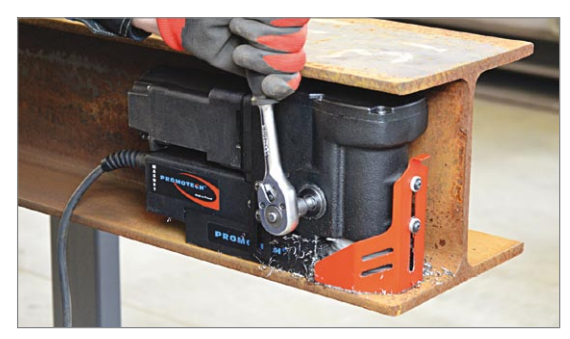
Compact design for height restricted areas. Detachable feed lever (feat. ratchet) can be fixed from either side.