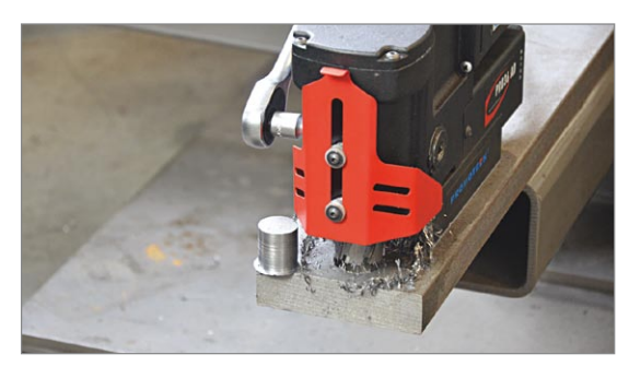
Max milling capacity up 36 mm (1-7/16").