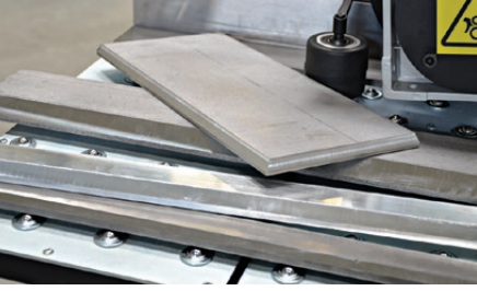
High quality bevel results