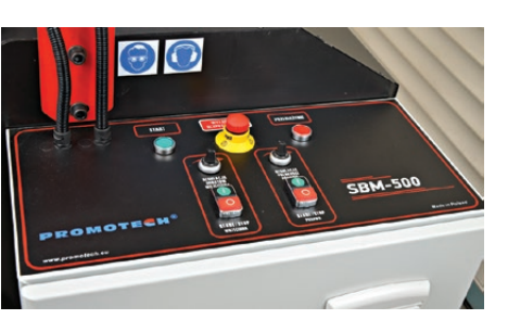
User-friendly control panel