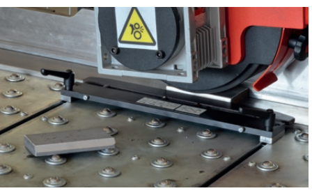
Attachment for narrow workpieces