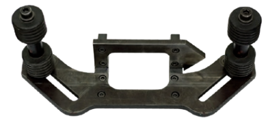
Optional guide for pipes Ø 260-600mm (10-24") Product code: PRW-0461-22-00-00-0