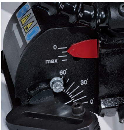
Continuous angle adjustment from 0 to 60 degrees.