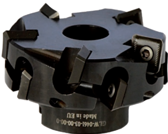
Mono block milling head, with 10 indexable inserts fixed with screws. Product code: GLW-0461-03-00-00-0

Standard universal guide plate for beveling both plates and pipes Ø 150-300mm (6-12")